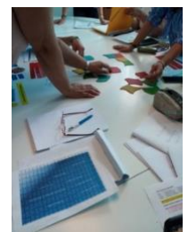
Some adult educators have already created their own activities and made their own materials.